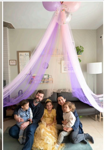
Not even her dad or brothers allowed.

In January, at a no cameras event, the Moroccan Derija Arabic Bible translation launch party took place. The first edition of this new testament translation was started in the 1920's and for the last almost 30 years this full translation project has been led by a team of nationals.